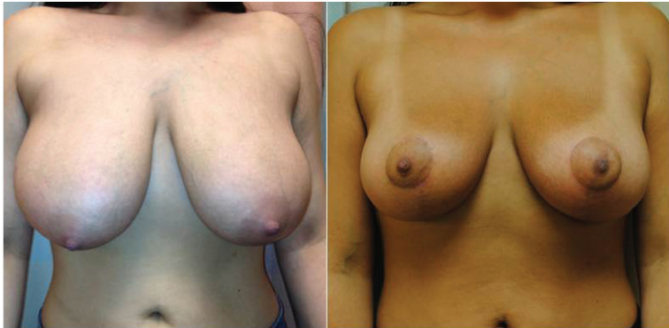
A woman who underwent mastopexy with subpectoral implants following partial mastectomy of the right breast. Preoperative (left) and postoperative (right) photos.

be performed during chemotherapy treatment, but rather that expansion should proceed following completion of all infusions.