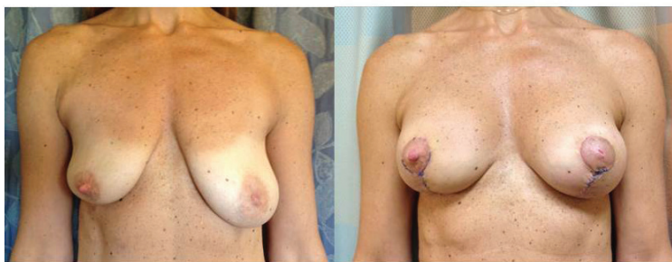
A woman who underwent mastopexy with subpectoral implants following partial mastectomy of the right breast. Preoperative (left) and postoperative (right) photos.

vestigators attributed this reduced incidence of complications in neoadjuvant patients to their younger age, fewer comorbidities, and lower incidence of smoking.